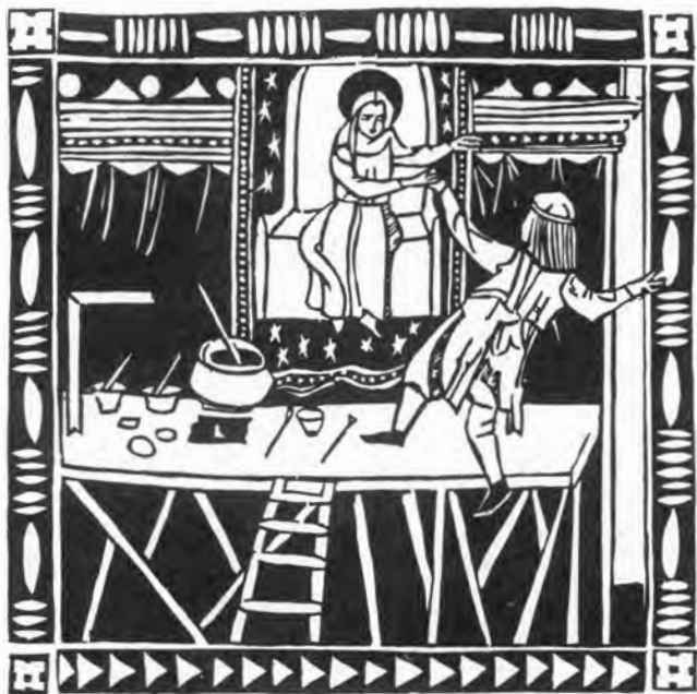
THE ARTIST SAVED BY THE VIRGIN HE HAS JUST PAINTED (15TH C. WOODCUT)

For further information write = SAGRADA ART STUDIOS 404 San Felipe Road, N.W. Albuquerque, New Mexico 87104